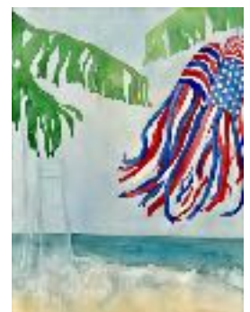
Lynn Holland "Stars and Stripes"