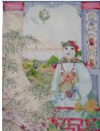
2nd Place, Donna Fuller Chinese Landscape